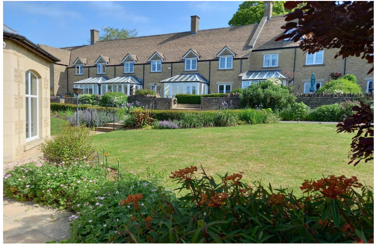
View from Swimming Pavillion

Cognatum Estates Limited provides the services and amenities shown below together with the maintenance, repair and insurance of the buildings, personal alarms, window cleaning and refuse collection. The cost of providing these services is shared equally between all properties.