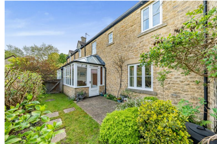
Rear with enclosed garden

Approximate Gross Internals: 102.1m 2 / 1100 ft 2 Service Charge: £8,940 pa Energy Performance Rating: D Council Tax Band: E