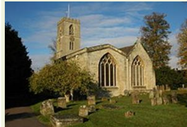
St Mary's Church