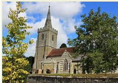
St Marys Church