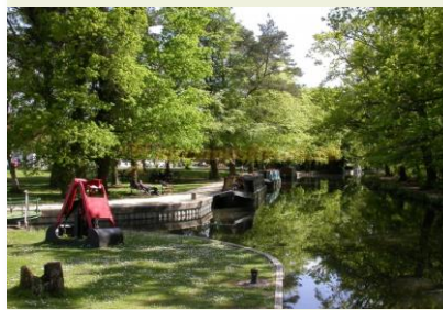
The Basingstoke Canal