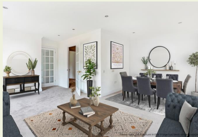
Sitting / Dining Room – Please note this has been virtually staged