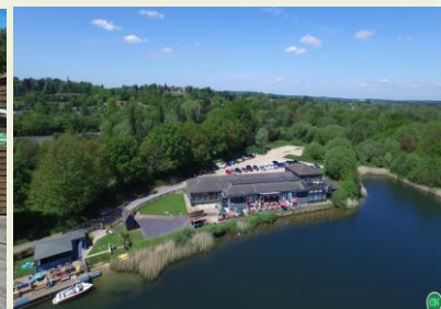
Kingfisher on the Quay

Cognatum Property Limited, Pipe House, Lupton Road, Wallingford, Oxfordshire OX10 9BS