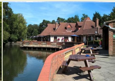
The Potters Bar