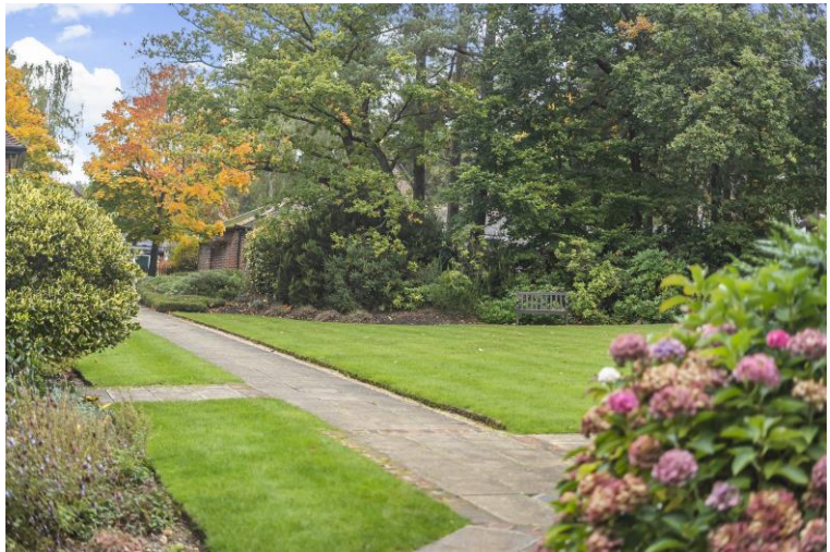
View from the property

Approximate Gross Internals: 89.4 m 2 / 962 ft 2 Service Charge: £7068 pa Energy Performance Rating: E Council Tax Band: TBC