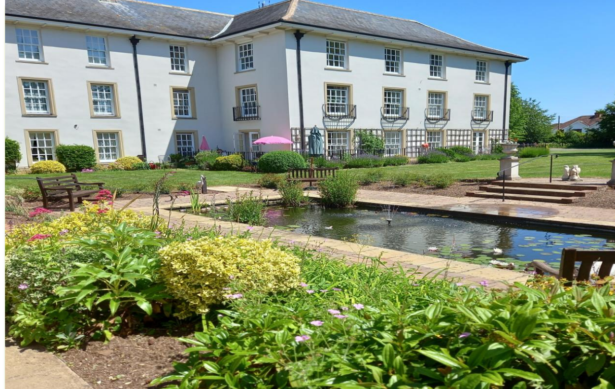
Fullands Court Gardens

Cognatum Estates Limited provides the services and amenities shown below together with the maintenance, repair and insurance of the buildings, personal alarms, window cleaning and refuse collection. The cost of providing these services is shared equally between all properties.