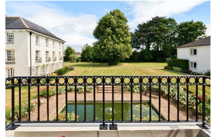
View from balcony

Approximate Gross Internals: 1426 Sq. Ft/ 132.6 Sq. m Service Charge: £6484 pa Energy Performance Rating: E Council Tax Band: F