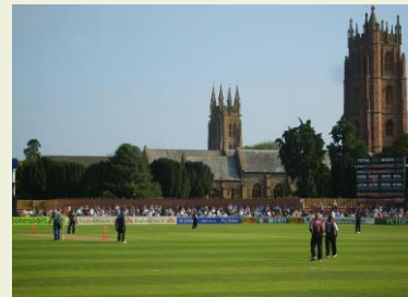
Somerset County Cricket Ground