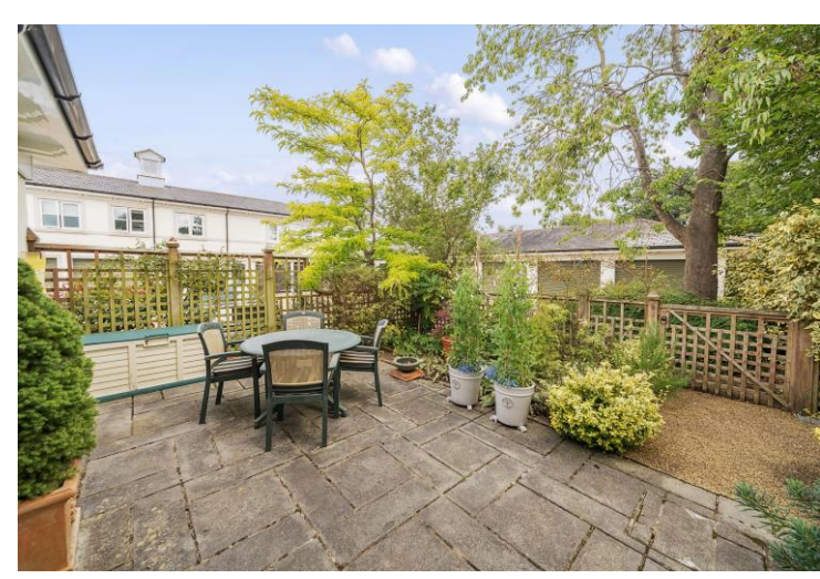
Rear with garden

Approximate Gross Internals: 121.3 m<sup>2</sup> / 1306 ft<sup>2</sup> Service Charge: £8,712 pa Energy Performance Rating: C Council Tax Band: E