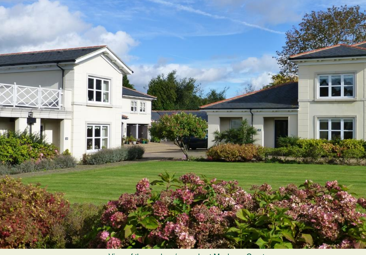
View of the gardens/grounds at Muskerry Court