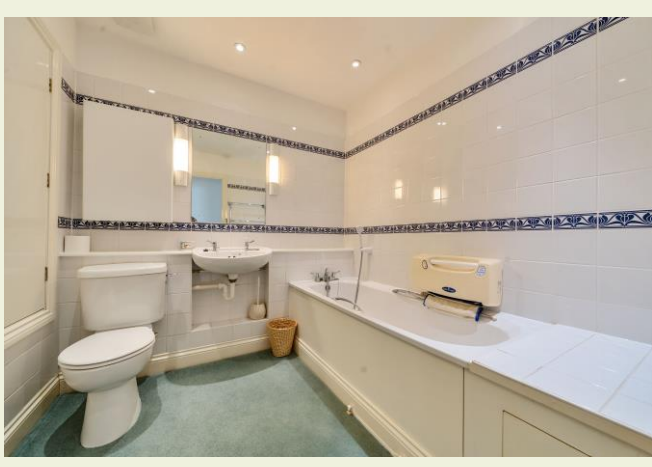
Bedroom 1 Bedroom 2 Bathroom