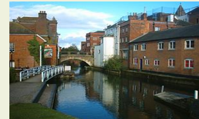
Kennet & Avon Canal

Cognatum Property Limited, Pipe House, Lupton Road, Wallingford, Oxfordshire OX10 9BS