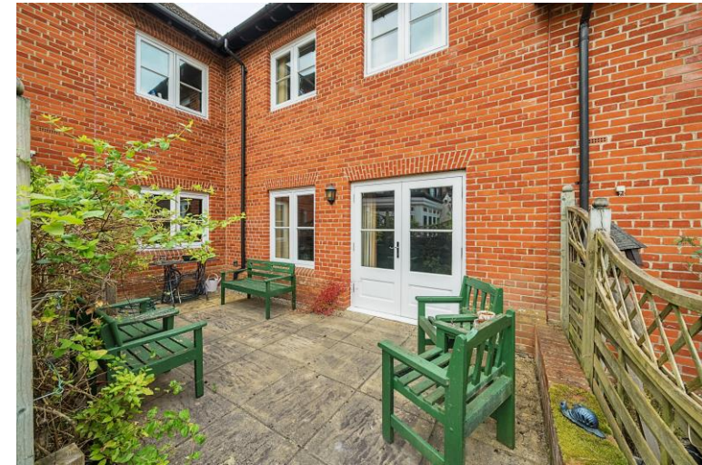
Rear with patio garden

Approximate Gross Internals: 137.1 m 2 / 1476 ft 2 Service Charge: £6,516 pa Energy Performance Rating: C Council Tax Band: C