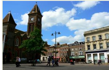
Newbury Market Place