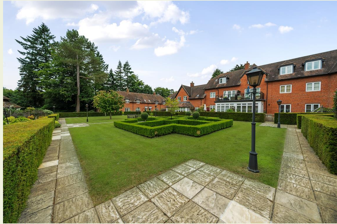
The central courtyard gardens