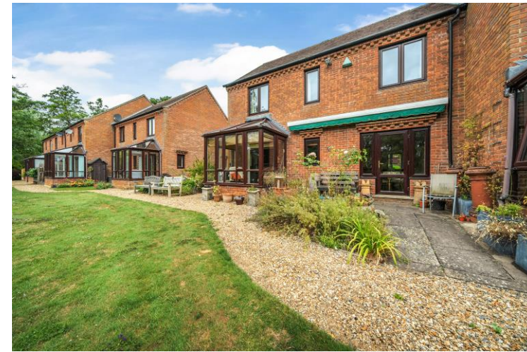
Rear with garden