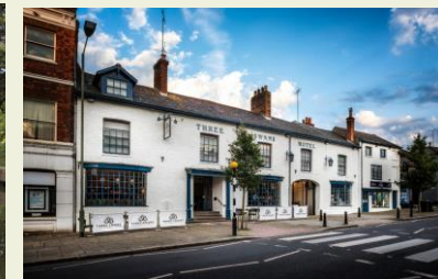
The Three Swans Hotel

Cognatum Property Limited, Pipe House, Lupton Road, Wallingford, Oxfordshire OX10 9BS