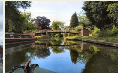
Kennet & Avon Canal