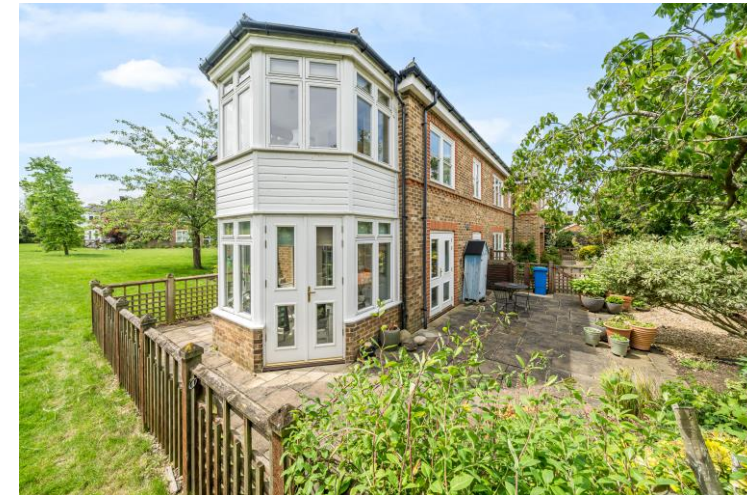
Rear with wrap around patio garden

Approximate Gross Internals: 97.2m 2 / 1046 ft 2