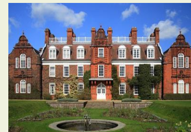
Girton College, Cambridge