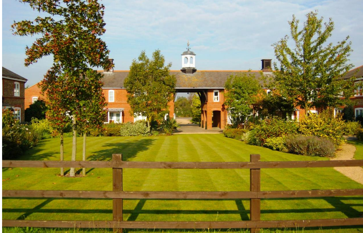
Churchfield Court Gardens