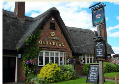
The Old Crown