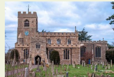
St Andrew's Church

Cognatum Property Limited, Pipe House, Lupton Road, Wallingford, Oxfordshire OX10 9BS