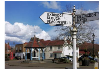
Ickenham Village Pump