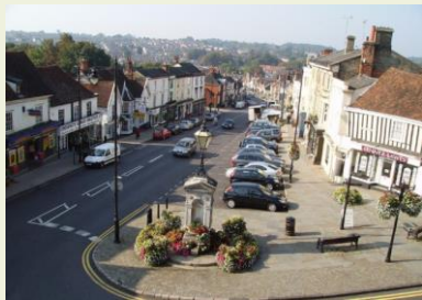
Halstead High Street