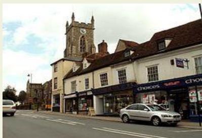
St Andrews Church