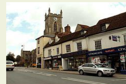
St Andrews Church

Cognatum Property Limited, Pipe House, Lupton Road, Wallingford, Oxfordshire OX10 9BS