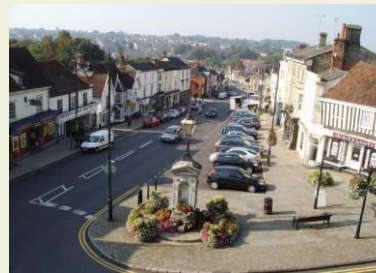
Halstead High Street