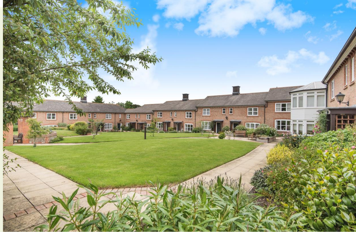
North Mill Place Gardens