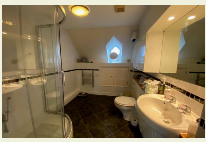
Bedroom 1 Upstairs Shower Room