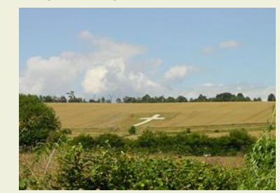
Chalk Cross War Memorial