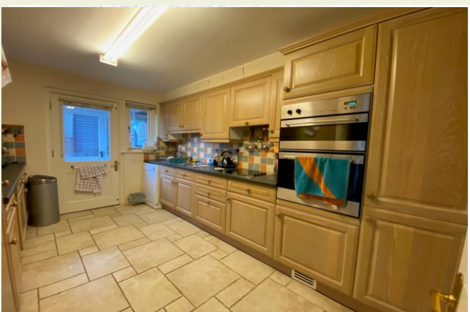
Sitting Room Dining Room Kitchen