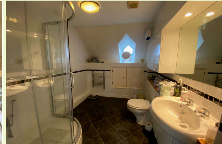
Upstairs Shower Room