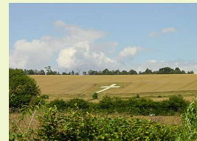
Chalk Cross War Memorial