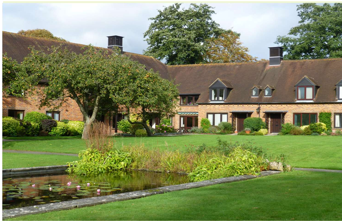
The gardens/grounds at Atwater Court