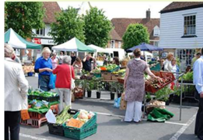
Lenham Sunday Market