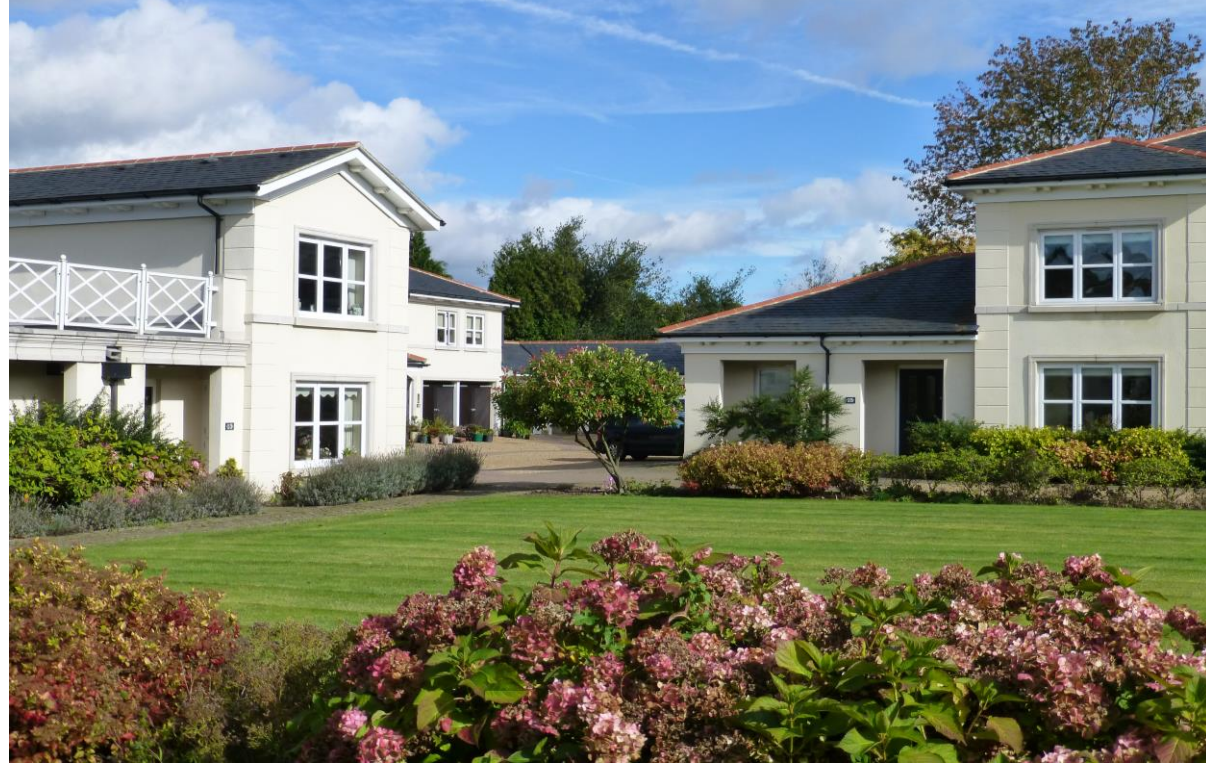
View of the gardens/grounds at Muskerry Court

Cognatum Estates Limited provides the services and amenities shown below together with the maintenance, repair and insurance of the buildings, personal alarms, window cleaning and refuse collection. The cost of providing these services is shared equally between all properties.