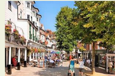
Royal Tunbridge Wells