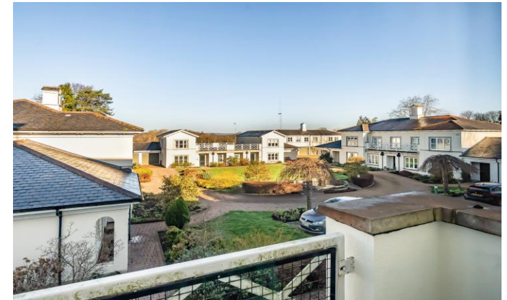
Photo of Estate Grounds

Approximate Gross Internals: 101.2 m 2 / 1090 ft 2 Service Charge: £8,712 pa Energy Performance Rating: (D) Council Tax Band: B