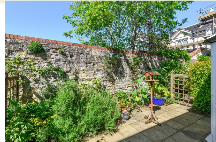
Rear Patio Garden

Approximate Gross Internals: 92.2 m 2 / 993 ft 2