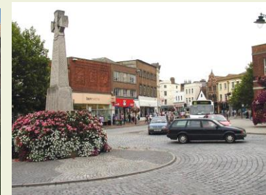
Taunton War Memorial

Cognatum Property Limited, Pipe House, Lupton Road, Wallingford, Oxfordshire OX10 9BS