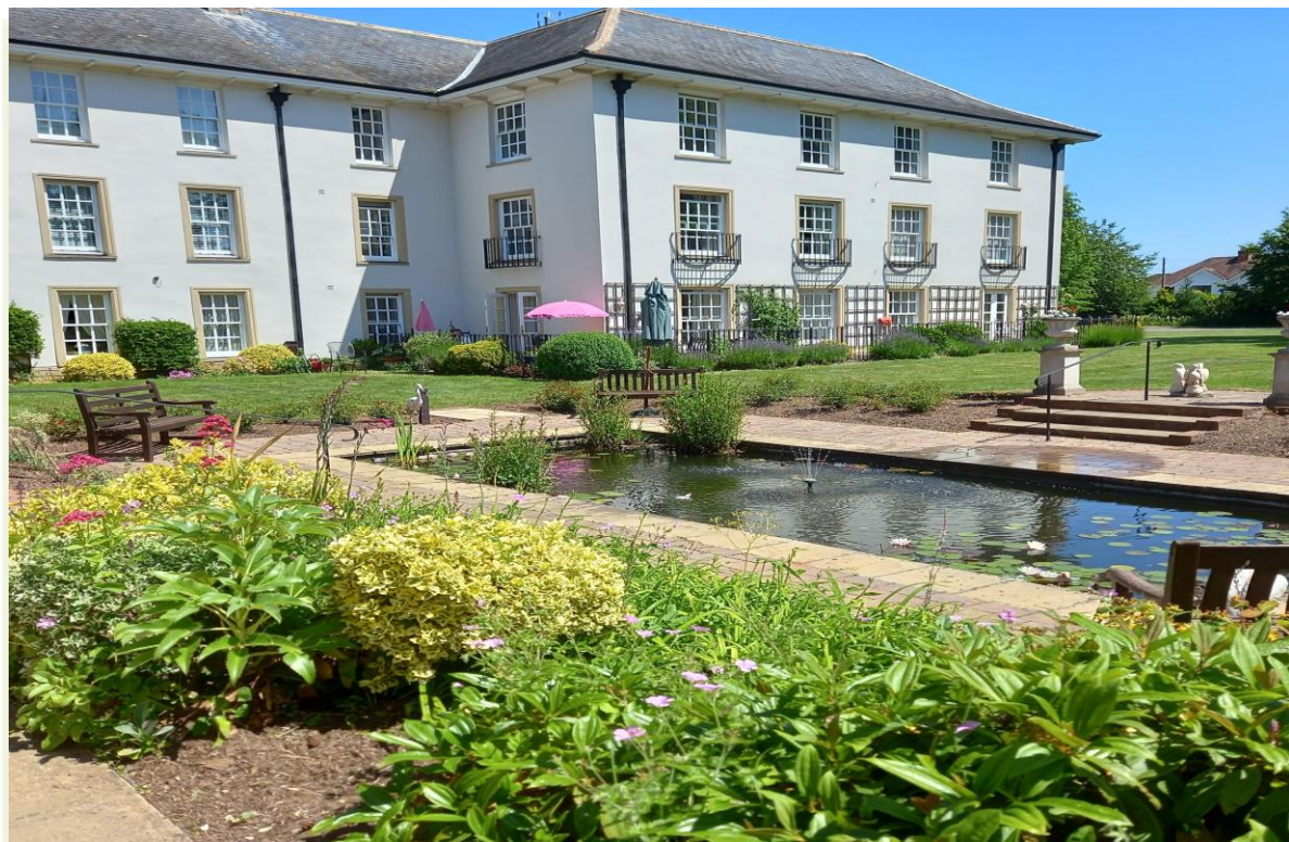
Fullands Court Gardens