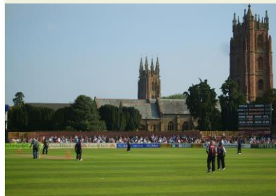
Somerset County Cricket Ground