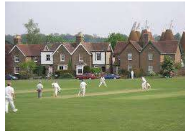
Bearsted Cricket Pitch