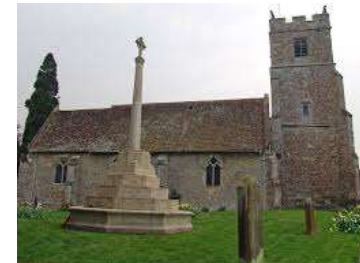
Holy Cross Bearstead