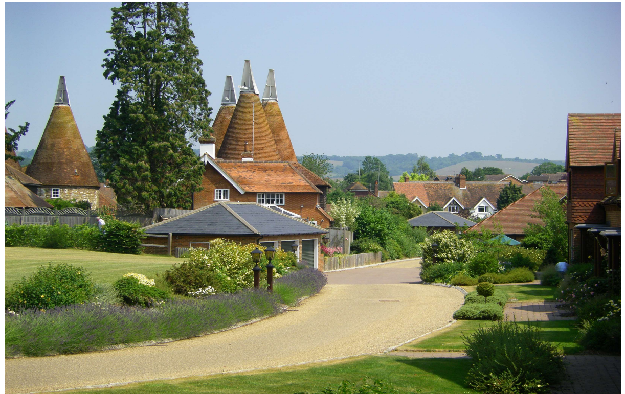
View of the Oast Houses from Eylesden Court