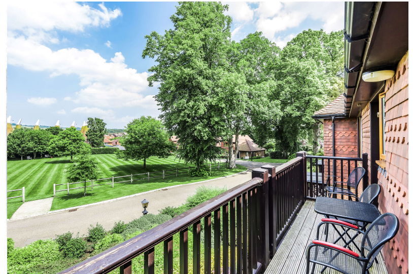
View from balcony

Approximate Gross Internals: 132.9 m 2 / 1431 ft 2