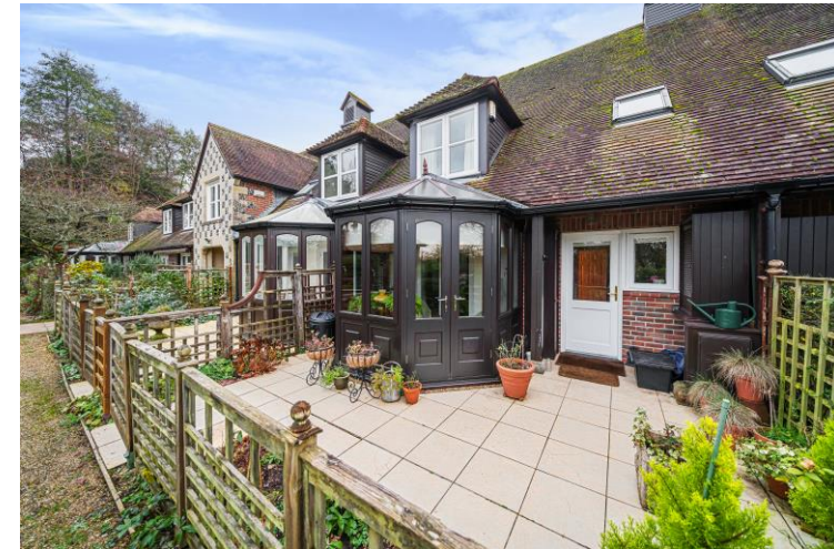
Rear with garden

Approximate Gross Internals: 109.9 m 2 / 1184ft 2