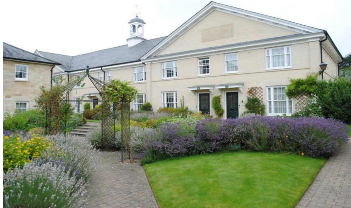
The gardens/grounds at St Luke's