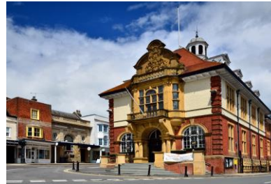
Marlborough Town Hall