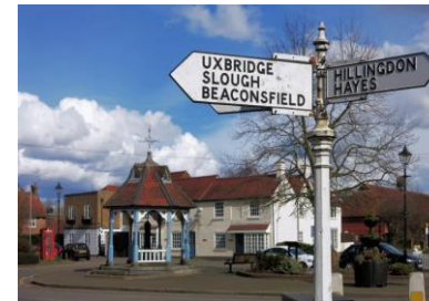
Ickenham Village Pump