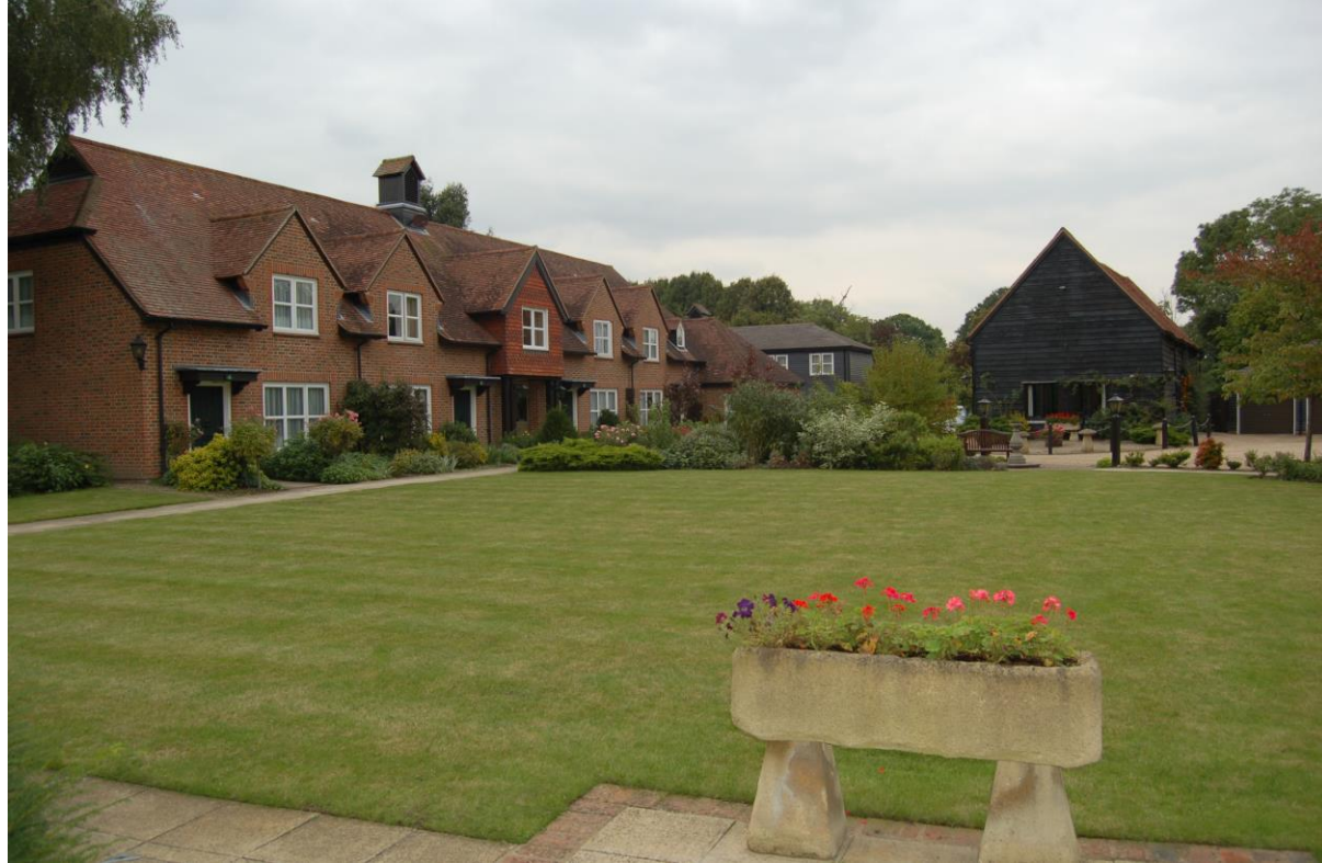
View of the gardens at Church Place