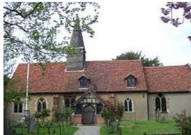
St Giles' Church