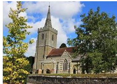
St Mary's Church