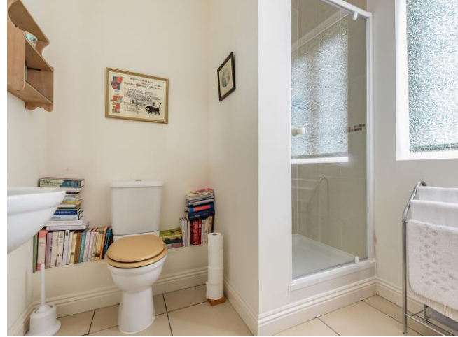
Downstairs Shower Room