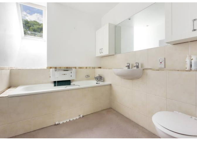
Bedroom 1 Bedroom 2 Bathroom