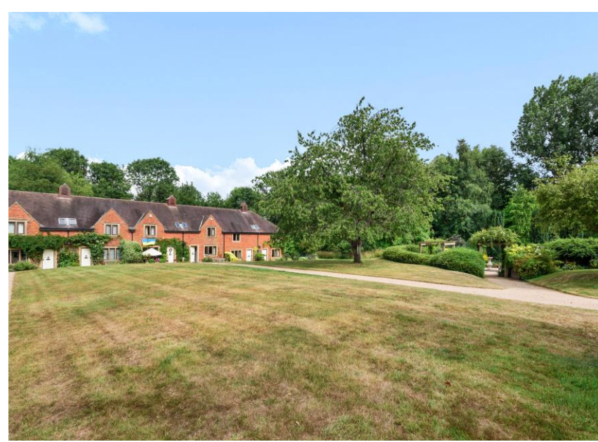
Manor Court Gardens

Approximate Gross Internals: 86.4m<sup>2</sup> / 930 ft<sup>2</sup> Service Charge: £6,831 pa Energy Performance Rating: D Council Tax Band: E