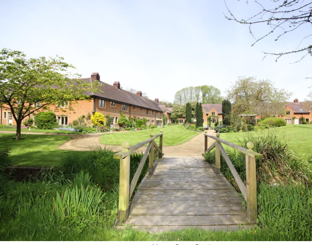
Manor Court Gardens