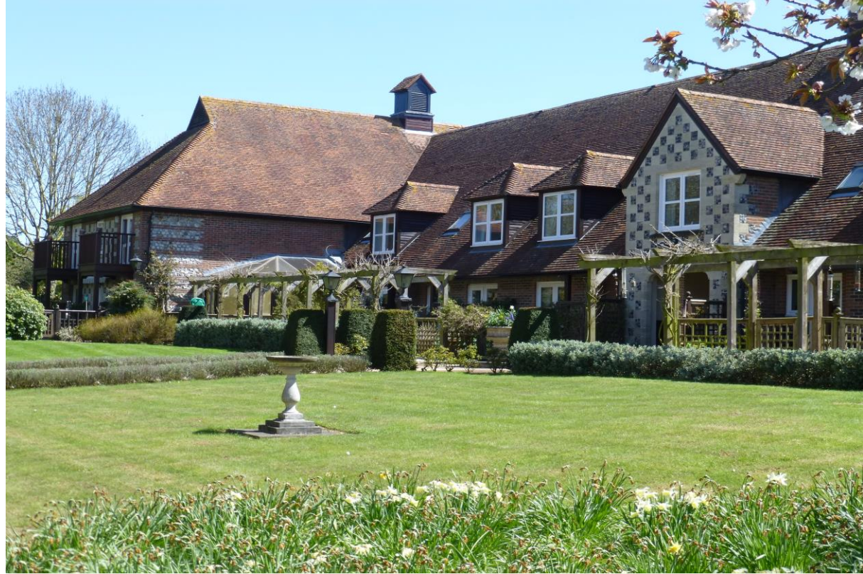
The gardens at Earls Manor Court