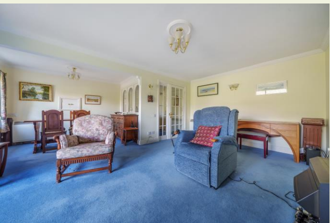
Sitting Room/ Dining Room

For viewings please call the Estate Manager on 01980 610883 / 07384 112899 (Mon-Fri 9am-5pm)