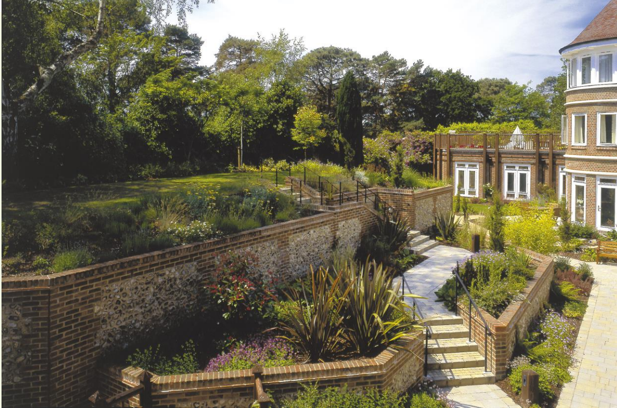
View of the gardens/grounds at Sandbourne Court