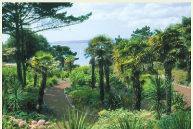
Alum Chine Tropical Gardens

Cognatum Property Limited, Pipe House, Lupton Road, Wallingford, Oxfordshire OX10 9BS