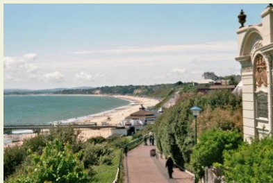
Bournemouth Sea Front & Pier