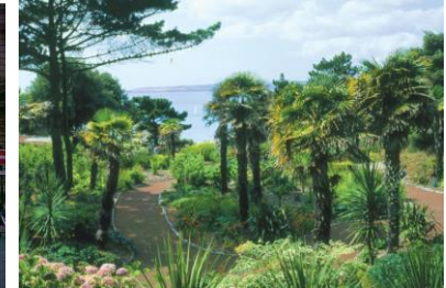
Alum Chine Tropical Gardens

Cognatum Property Limited, Pipe House, Lupton Road, Wallingford, Oxfordshire OX10 9BS