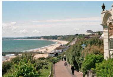
Bournemouth Sea Front & Pier