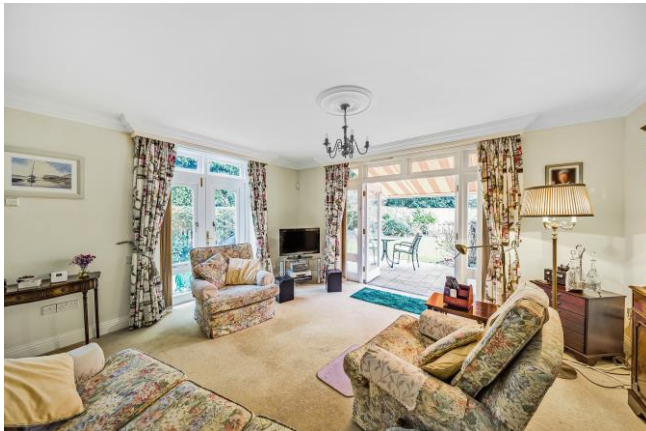
Sitting Room/Dining Area

For viewings please call the Estate Manager on 01202 761 582 / 07384 112 160 (Mon-Fri 9am-5pm)