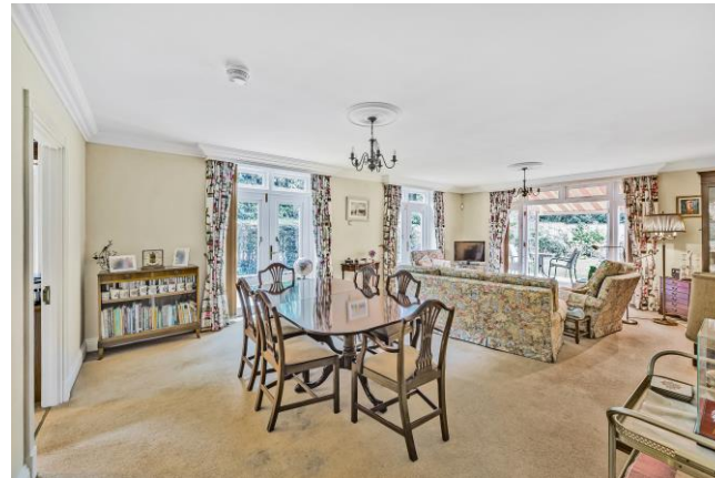
Sitting Room/Dining Area