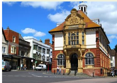
Marlborough Town Hall