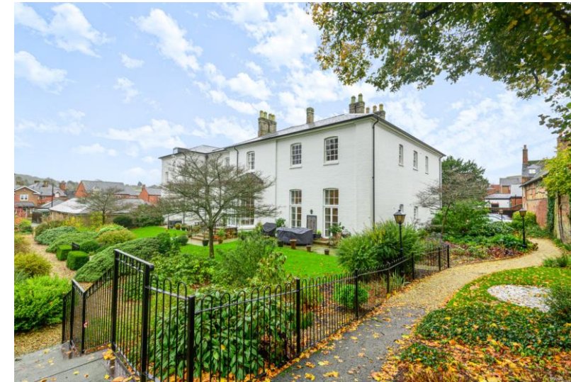
Rear of Wye House

Approximate Gross Internals: 83.4 m 2 / 898 ft 2