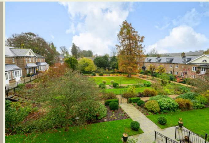
View from apartment