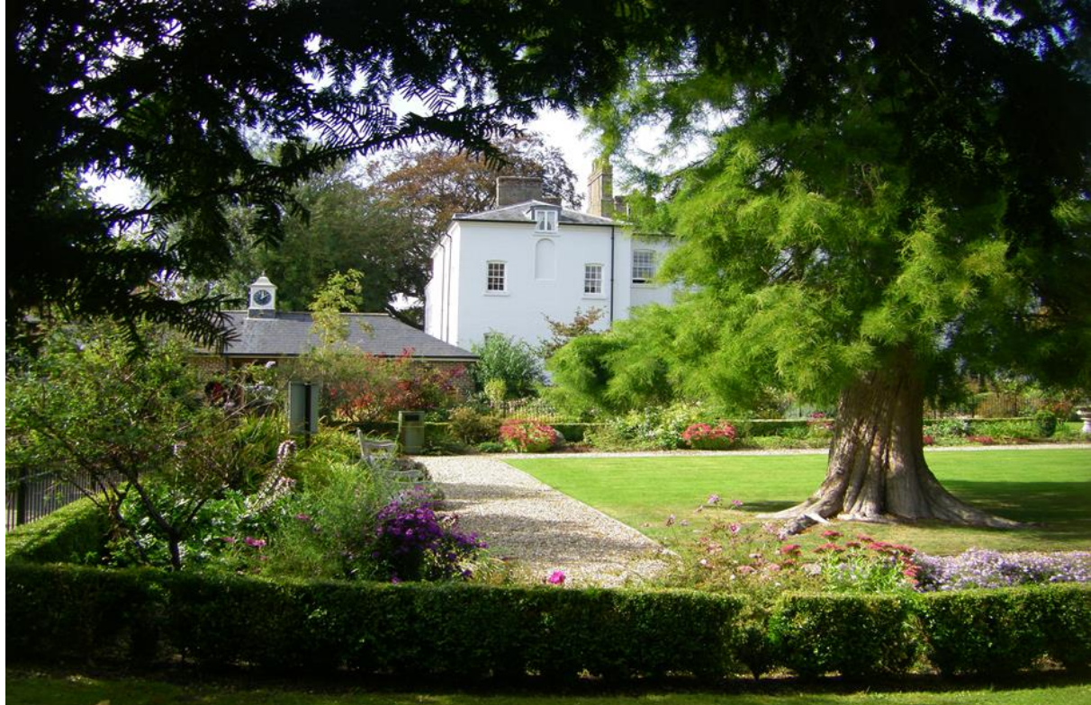
The Central Courtyard Gardens at Wye House