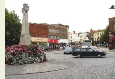
Taunton War Memorial

Cognatum Property Limited, Pipe House, Lupton Road, Wallingford, Oxfordshire OX10 9BS