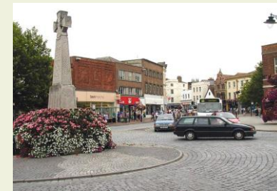
Taunton War Memorial

Cognatum Property Limited, Pipe House, Lupton Road, Wallingford, Oxfordshire OX10 9BS