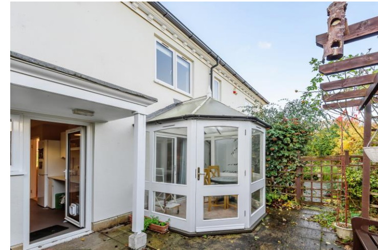
Rear with conservatory and patio garden

Approximate Gross Internals: 103.6 m 2 / 1115 ft 2 Service Charge: £6,484 pa Energy Performance Rating: E Council Tax Band: F