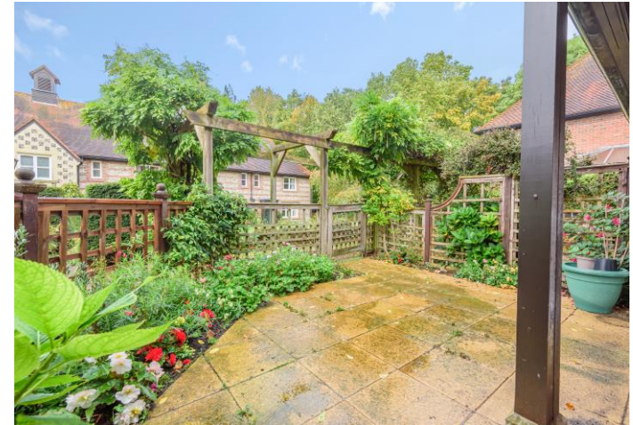
Rear with garden

Approximate Gross Internals: 117.7m 2 / 1267ft 2 Service Charge: £7,992 pa Energy Performance Rating: D Council Tax Band:G