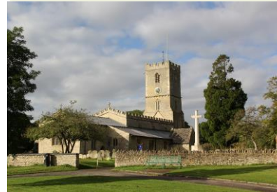
Church of St Denis