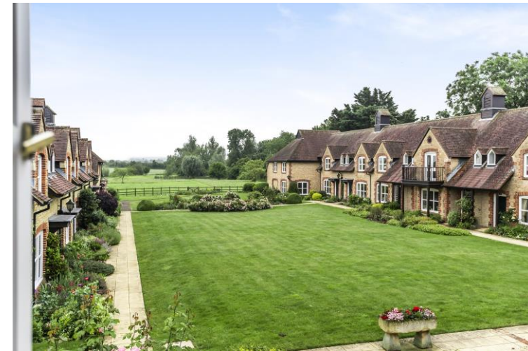
Courtyard gardens with meadows beyond

Approximate Gross Internals: 106.1 m 2 / 1142 ft 2 Service Charge: £ 7452 pa Energy Performance Rating: D (65) Council Tax Band: G