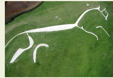
White Horse Uffington

Cognatum Property Limited, Pipe House, Lupton Road, Wallingford, Oxfordshire OX10 9BS