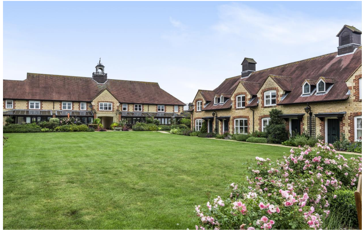
View of Penstones Court