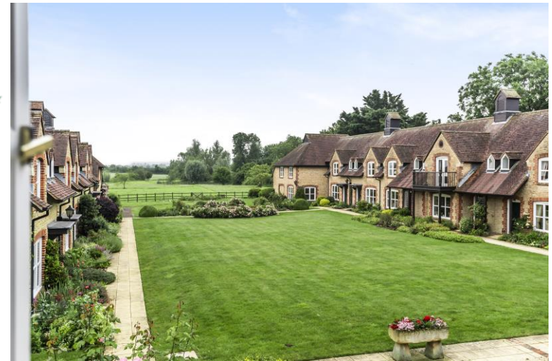
Courtyard gardens with meadows beyond

Approximate Gross Internals: 106.1 m 2 / 1142 ft 2