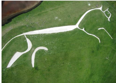
White Horse Uffington