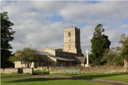
Church of St Denis