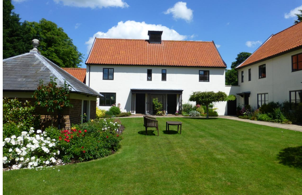
The Central Lawn