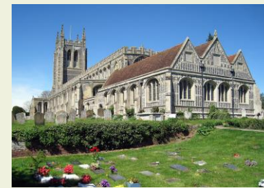
Holy Trinity Church