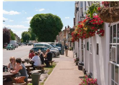
Long Melford High Street