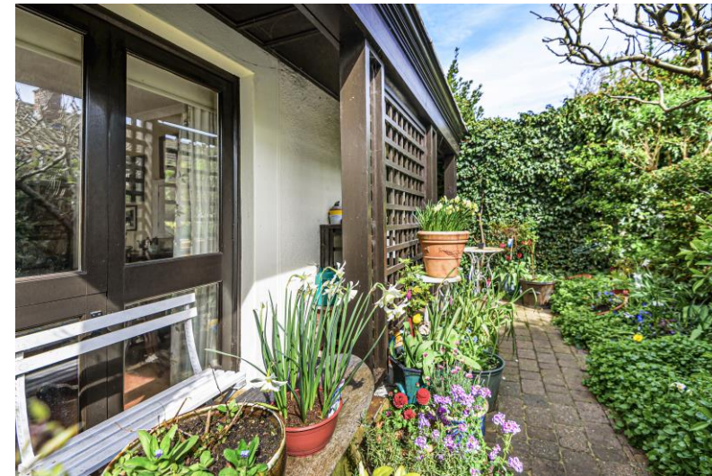
Rear with garden

Approximate Gross Internals: 110 m 2 / 1189 ft 2 Service Charge: £ 9,148 pa Energy Performance Rating: E Council Tax Band: E