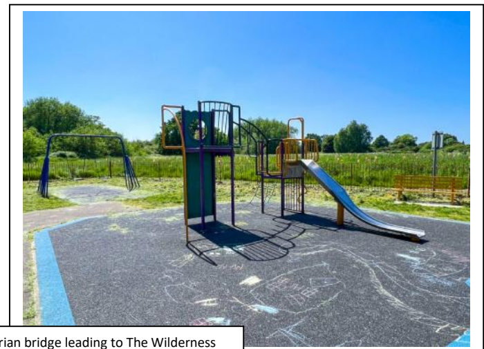
Easy reach of the River Mole with pedestrian bridge leading to The Wilderness recreational fields/Nelson recreation grounds and children's playground