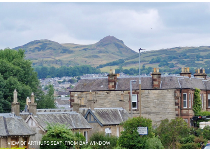
VIEW OF ARTHURS SEAT FROM BAY WINDOW