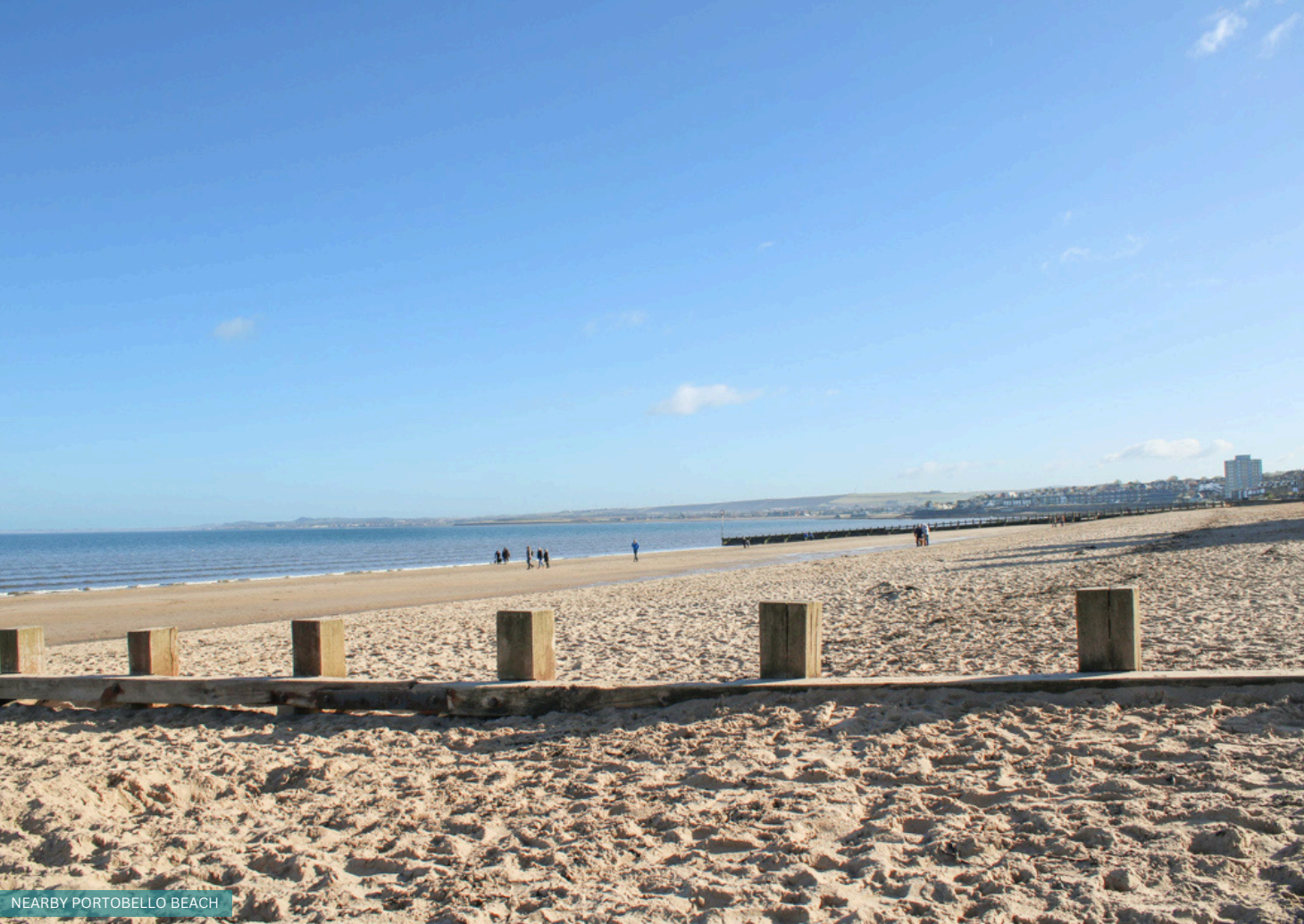
NEARBY PORTOBELLO BEACH