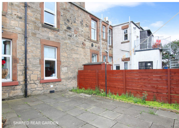
SHARED REAR GARDEN