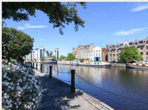
The Shore, Port of Leith

The vibrant Shore area lies in the historic Port of Leith. A wealth of bars, cafes and Michelin starred restaurants, line the Water of Leith. Nearby is the Ocean Terminal Shopping Centre, offering high street shopping and includes a Pure Gym, Vue Cinema and moored alongside is the famous Royal Yacht Britannia and the head quarters of the Scotland Office. The wide open park of Leith Links, is nearby and a great social hub with local activity clubs. The old Victoria Baths are close by, now a leisure centre, with swimming pool and fitness centre. The Water of Leith cycle path network is easily accessible with pedestrian/cycle routes, safely connecting you through the city and outlying areas. An excellent number of regular bus routes and the trams, service the area, taking you through the city centre and then west to the Gyle Business Park and Edinburgh airport.