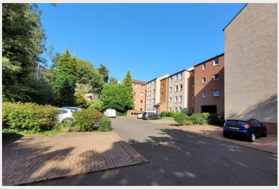
SECURE REAR PARKING

home report. These particulars do not form part of any contract and the statements or plans contained herein are not warranted nor to scale. Approximate measurements have been for efficiency or safety and no warranty is given as to their compliance with any regulations Confirmation of Council tax bands can be obtained from the local Council websites. Where are not always in a position to verify, prior to preparation of the schedule of particulars, that all necessary Local Authority consents are available.