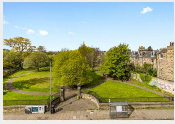
NORTH JUNCTION STREET PARK OPPOSITE FLAT

contained herein are not warranted nor to scale. Approximate measurements have been for efficiency or safety and no warranty is given as to their compliance with any regulations Confirmation of Council tax bands can be obtained from the local Council websites. Where are not always in a position to verify, prior to preparation of the schedule of particulars, that all necessary Local Authority consents are available.