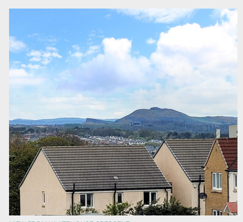
VIEW FROM WHITEHOUSE CRESCENT

Interested parties are advised to note interest through a solicitor, so that they are notified of any closing date, and on whose behalf their solicitor may request a copy of the seller's home report. These particulars do not form part of any contract and the statements or plans contained herein are not warranted nor to scale. Approximate measurements have been taken by electronic device at the widest point. Services and appliances have not been tester for efficiency or safety and no warranty is given as to their compliance with any regulations. Confirmation of Council tax bands can be obtained from the local Council websites. Where the property has been altered or extended in any way by the sellers or previous owners, we are not always in a position to verify, prior to preparation of the schedule of particulars, that all necessary Local Authority consents are available.