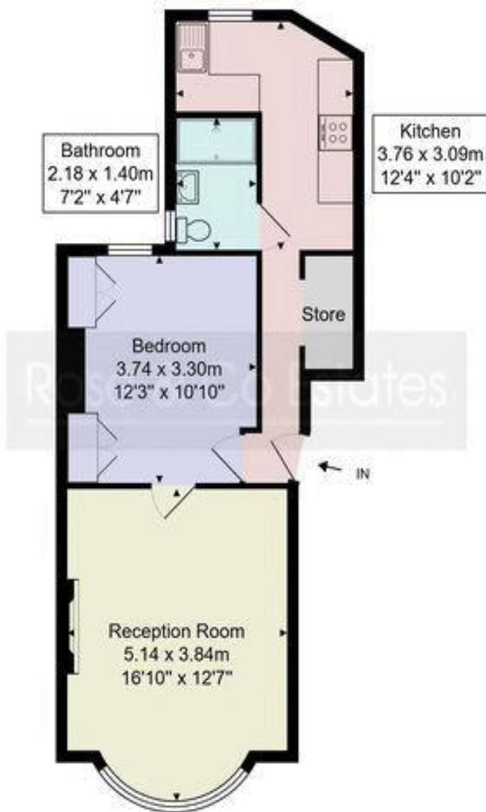
Raised Ground Floor