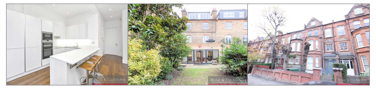
Asking Price £1,990,000 Subject to contract