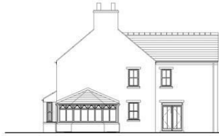
PROPOSED SIDE SOUTH ELEVATION scale 1:100