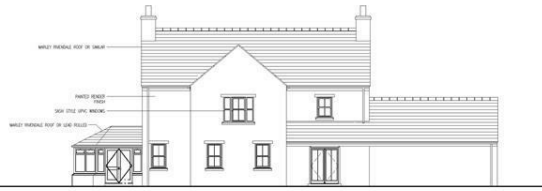
PROPOSED REAR EAST ELEVATION scale 1:100