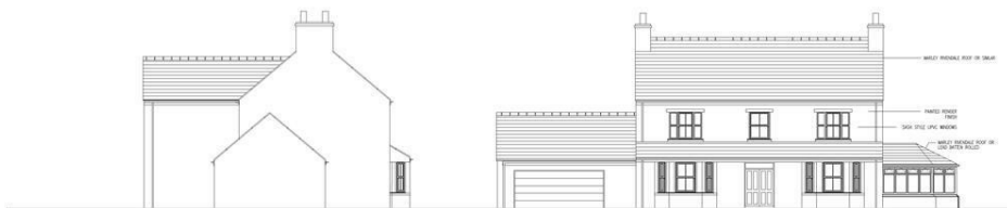
PROPOSED SIDE NORTH ELEVATION scale 1:100