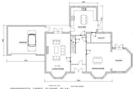
PROPOSED FIRST FLOOR PLAN scale 1:100