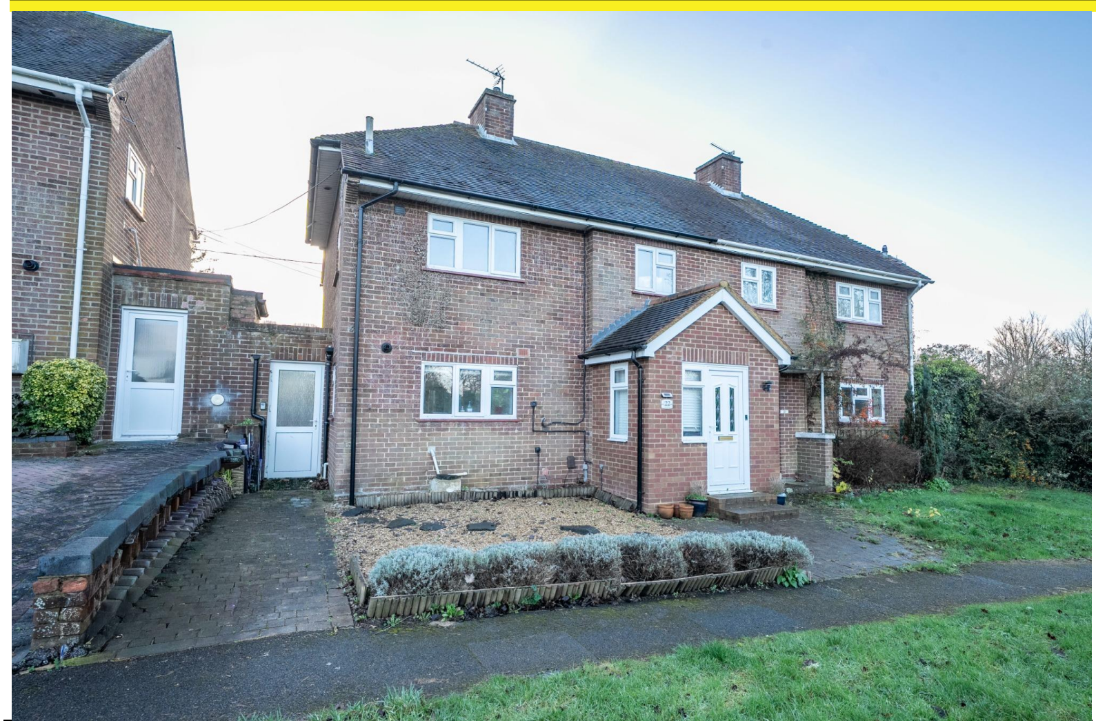
Sheep Fair, Andover Guide Price £340,000 Freehold

This floor plan is for representation purposes only as defined by the RICS code of Measuring Practice (and IPMS where requested) and should be used as such by any prospective purchaser. Whilst every attempt has been made to ensure the accuracy contained here, the measurement of doors, windows and rooms is approximate and no responsibility is taken for any error, omission or mis-statement. Specifically no guarantee is given on the total area of the property if quoted on the plan. Any figure provided is for guidance only and should not be used for valuation purposes. Produced for Austin Hawk Ltd