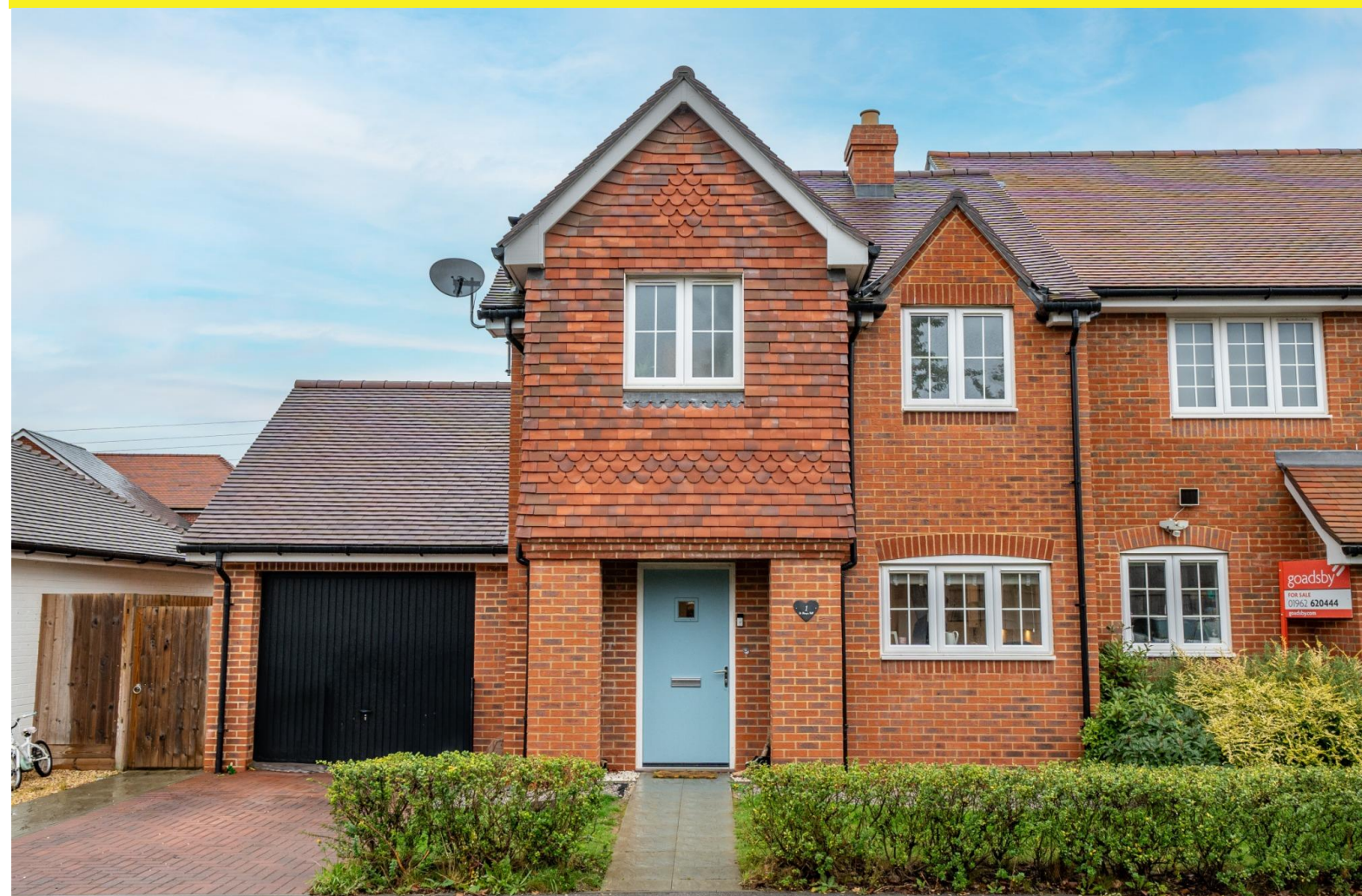
St Marys Hill, Hurstbourne Priors

NOTE: These particulars are only intended as a guide to prospective purchasers with a view to taking up negotiations. They are not intended to be relied upon in any way for any purpose and accordingly neither their accuracy nor their continued availability is in any way guaranteed. They are furnished on the express understanding that neither the Agents nor the Vendors are under any liability or claim in respect of their contents. Any prospective purchaser must satisfy themselves by inspecting or otherwise as to the correctness of the particulars contained.