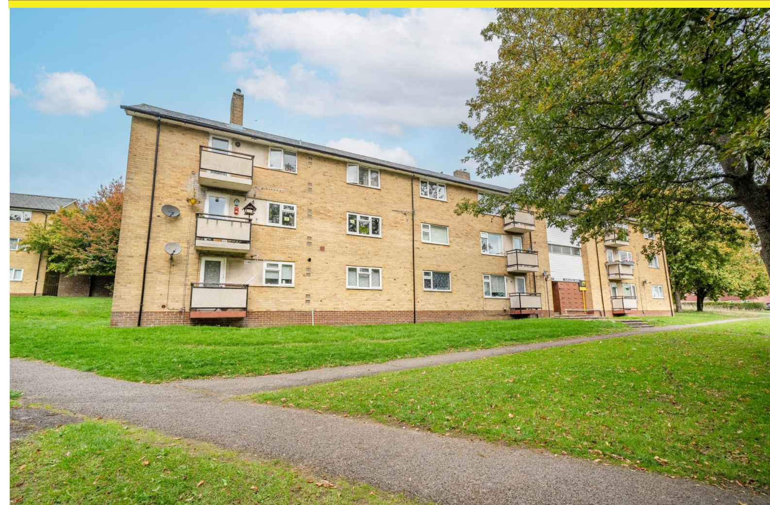
Alexander House, Tidworth