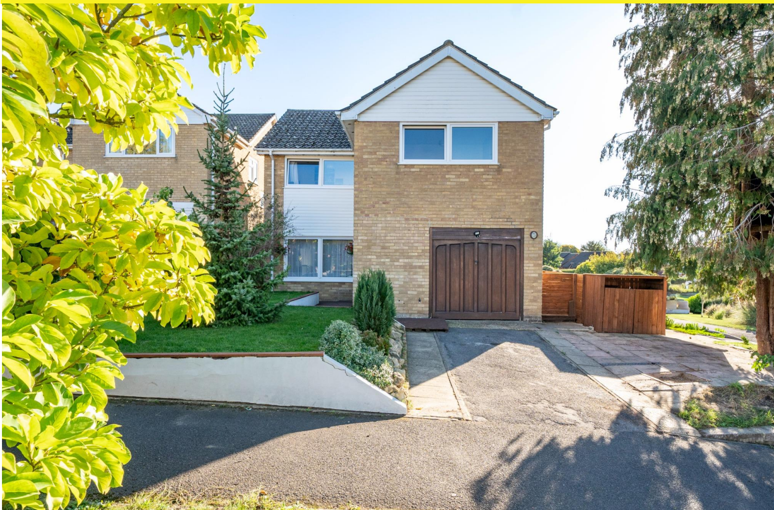
Meliot Rise, Andover Guide Price £479,950 Freehold