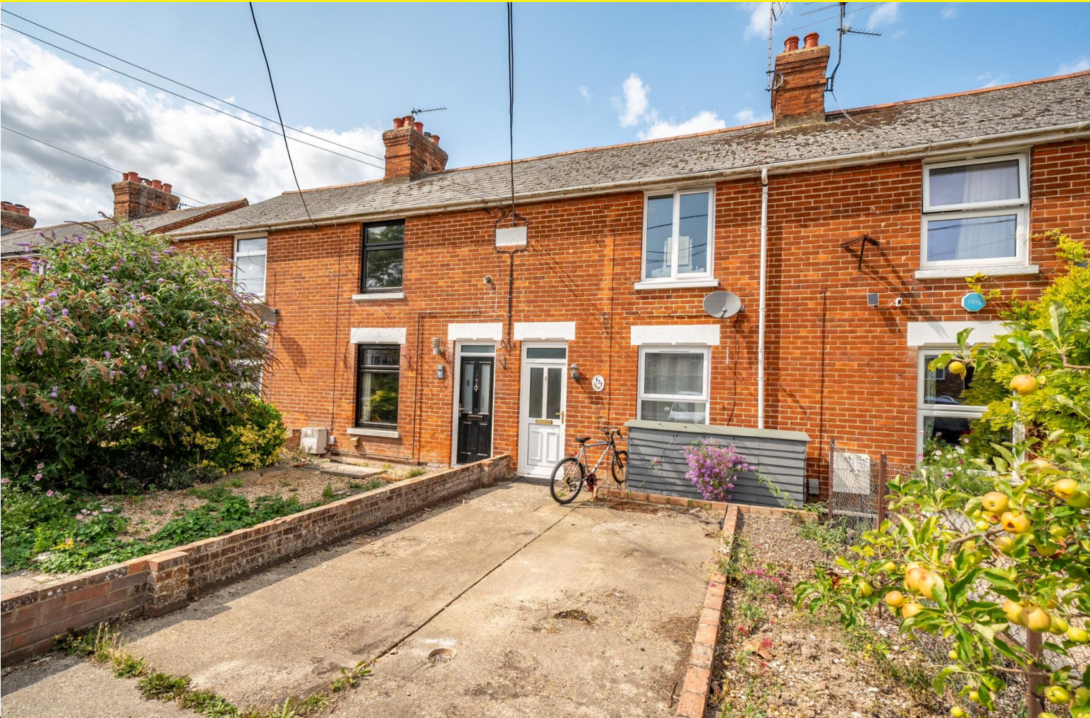
Vigo Road, Andover Guide Price £225,000 Freehold