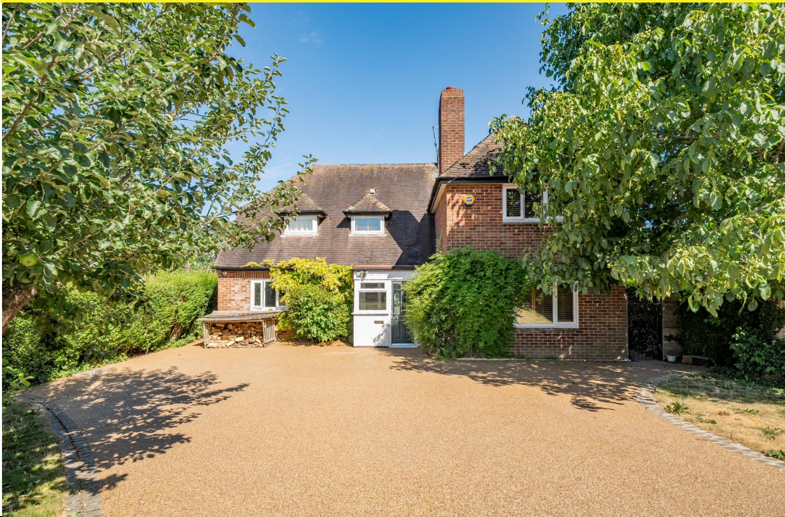
Vigo Road, Andover Guide Price £750,000 Freehold