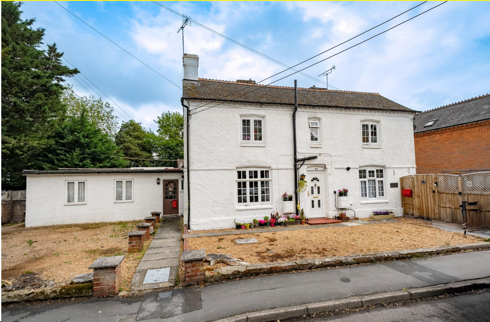
2 Stewart House, Andover Guide Price £169,950 Share of Freehold

NOTE: These particulars are only intended as a guide to prospective purchasers with a view to taking up negotiations. They are not intended to be relied upon in any way for any purpose and accordingly neither their accuracy nor their continued availability is in any way guaranteed. They are furnished on the express understanding that neither the Agents nor the Vendors are under any liability or claim in respect of their contents. Any prospective purchaser must satisfy themselves by inspecting or otherwise as to the correctness of the particulars contained.