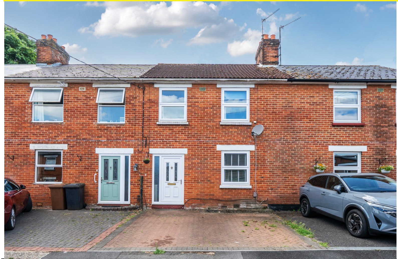
Leicester Place, Andover Guide Price £290,000 Freehold