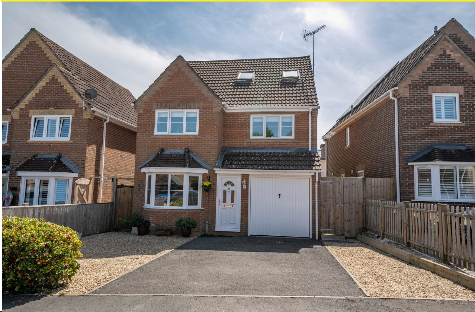
Kingfishers, Shipton Bellinger Guide Price £490,000 Freehold