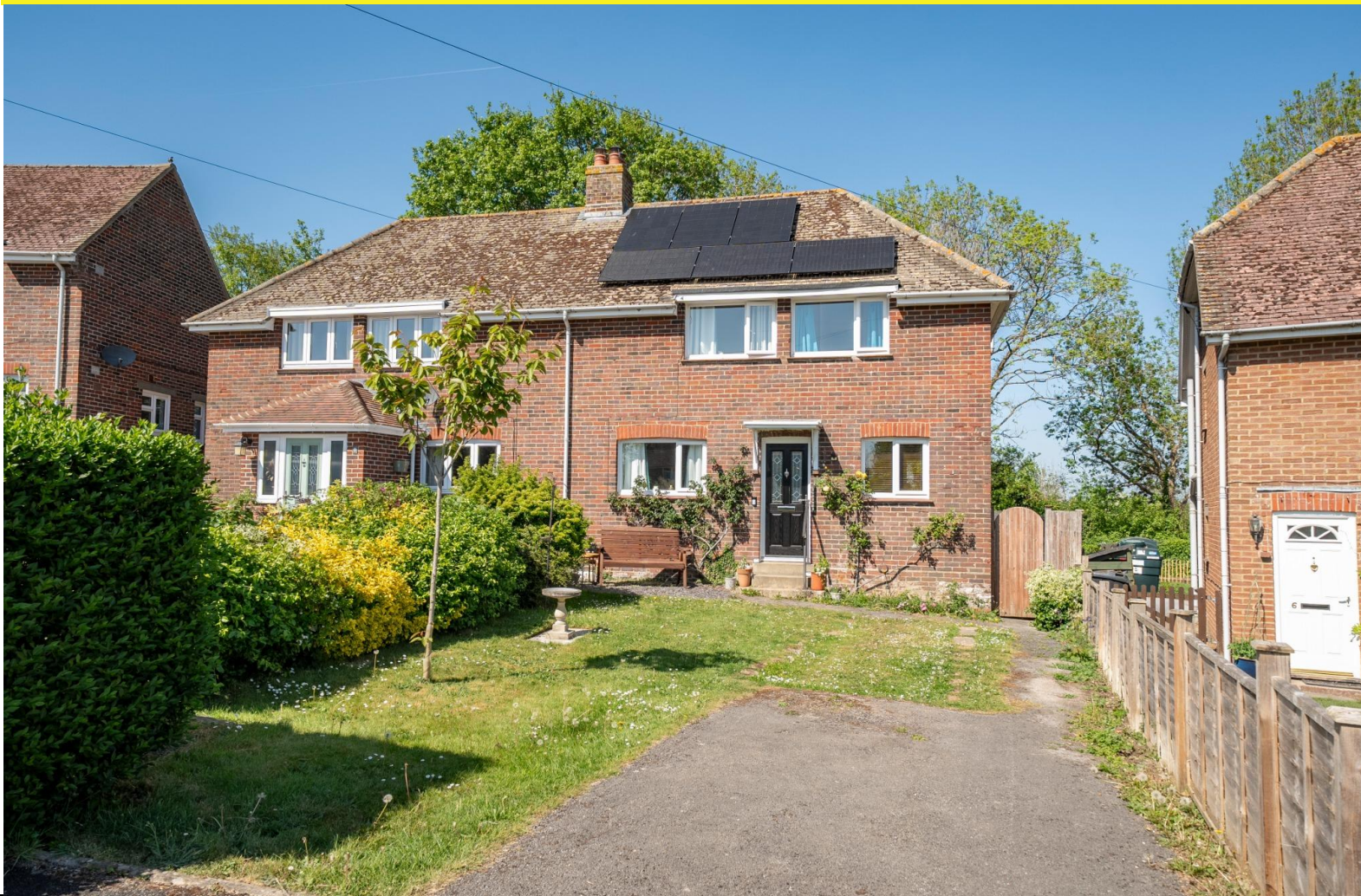
Roman Road, Stockbridge OIEO £350,000 Freehold

NOTE: These particulars are only intended as a guide to prospective purchasers with a view to taking up negotiations. They are not intended to be relied upon in any way for any purpose and accordingly neither their accuracy nor their continued availability is in any way guaranteed. They are furnished on the express understanding that neither the Agents nor the Vendors are under any liability or claim in respect of their contents. Any prospective purchaser must satisfy themselves by inspecting or otherwise as to the correctness of the particulars contained.